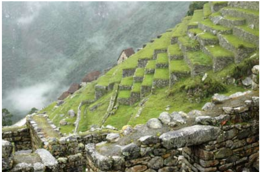
Terraces lining a mountain.

I have given you a lot of information on how Inca society worked and functioned. With all the information above I think I've proven to you why the Incas were a highly advanced civilization. In my article I only told you about Inca government and a little about Inca military tactics but, with that information already you can see how great the Incas were.