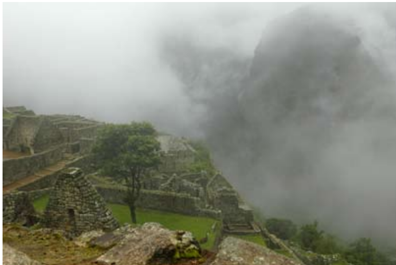
Thick fog covers an ancient Inca village.

Stew was common. Stews were cooked in ceramic pots. The most important of the foods were maize (corn), quinoa (a grain with lots of protein), and potatoes. Chili peppers were popular choices used to add flavor and spice to foods. Bread was easily made. Chicha was the most popular drink. It was alcoholic and made