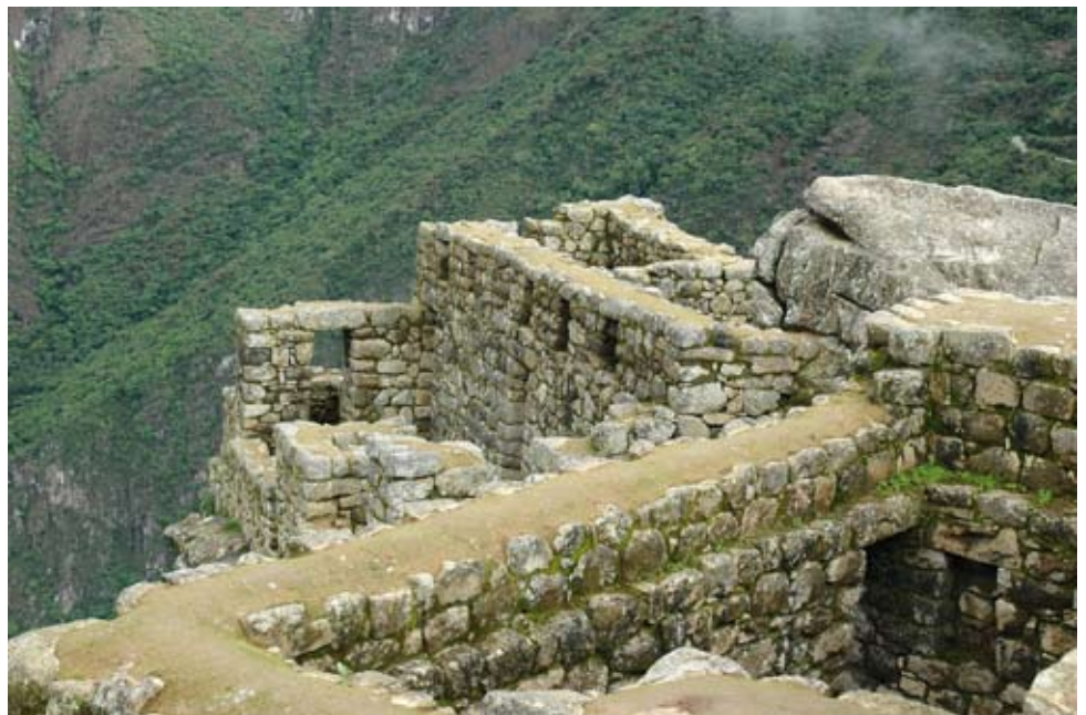
A cozy Inca house.

Spanish, the Inca would bury their nobles with their peasants. Although the nobles were buried in silk and gold weavings, peasants and nobles were still buried together. Archaeologists have found human remains in many different ways; they found bodies mummified by being preserved by other bodies or by environmental conditions, for instance extreme cold or dryness. In late 2002, archaeologists found two thousand bodies in the